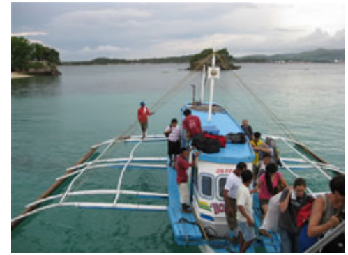
Traveling to Boracay

Camp Site. Official registration already started on the evening of the 19th for the early arrivals. At