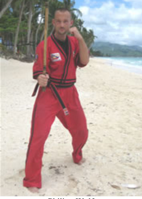
DAV since 1985 www.modernarnis.de