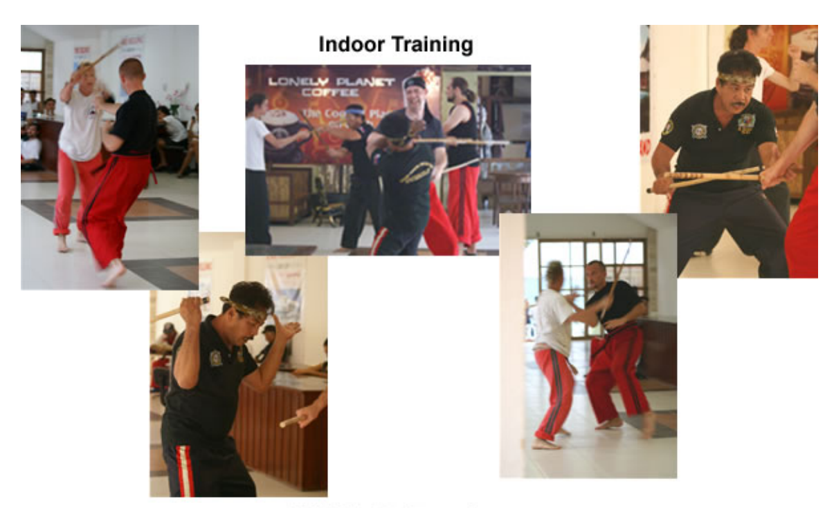
Nightly Get Together