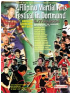
2nd FMA Festival