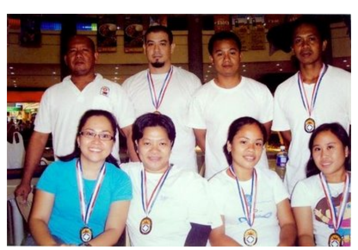
Team Arnis Unlimited fighters with their medals

Silvers, and 3 Bronzes. Golden Kamagong Arnis Eskrima for its part won 2 Bronzes. Team Arnis Unlimited and Golden Kamagong Arnis Eskrima are spearheading the propagation of IMAFP Sports Arnis in Negros Island.