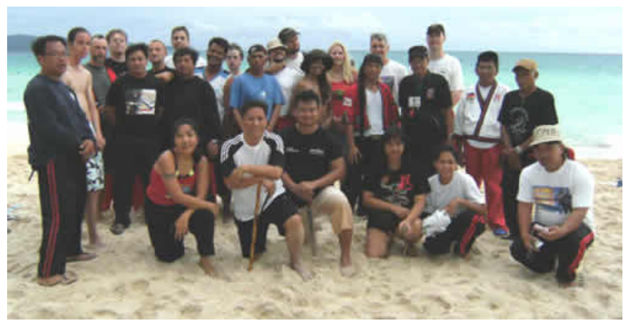
After a day's training, Arnisadors gather on the beach

The trip to Iloilo after the camp was quite a challenge due to road damage by the recent typhoon. Iloilo City was the ideal setting for the gala night, being one of the seats of arnis history dating back to the time of the first Bornean datus. The only thoughts I have to add would be the wonderful impression made by the local arnis children performing classical fighting dances in awesome acrobatic moves and flowing grace. It brought to