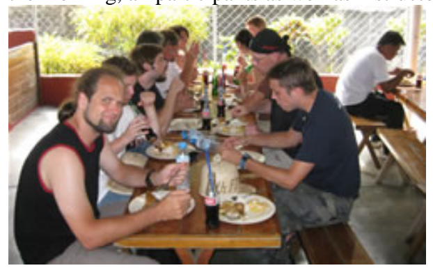
German delegation enjoying the chicken

On the 26th, we started our journey to Iloilo. After taking a boat ride from Boracay to Caticlan in the morning, all participants as well as instructors