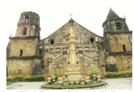
The Miag-ao Church in Iloilo symbolizes culture and history

mind the suitability of teaching the Filipino martial arts even to very young practitioners and helping them to grow up in the spirit and guided by the values of their warrior heritage.