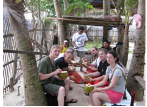
Enjoying fresh coconuts during break in between training sessions