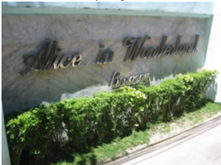
Entrance of Alice Boracay Resort