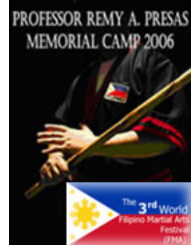
3rd FMA Festival