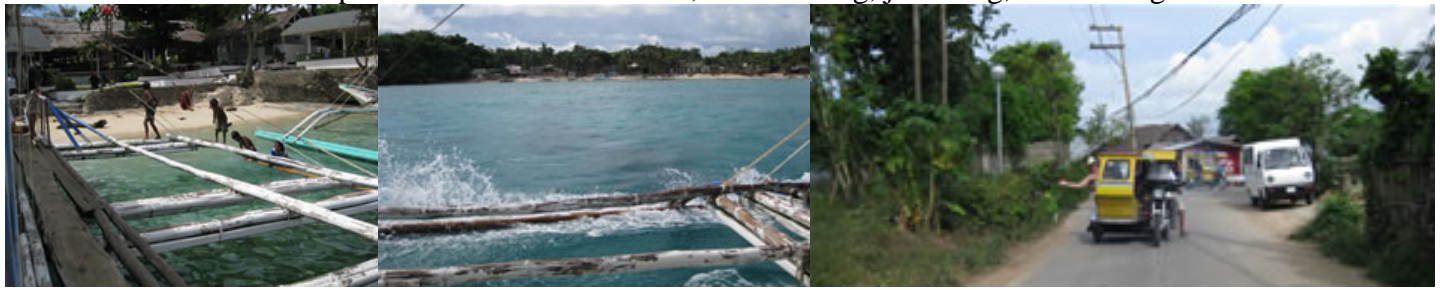
On the way to island hopping and a picture from the boat

Besides the pre arranged program, the island also offered all options of recreation from trekking tours through the mountains and jungle to sunset-sailing and naturally all sorts of water sports like banana boat rides, scuba diving, jet skiing, kite surfing etc.