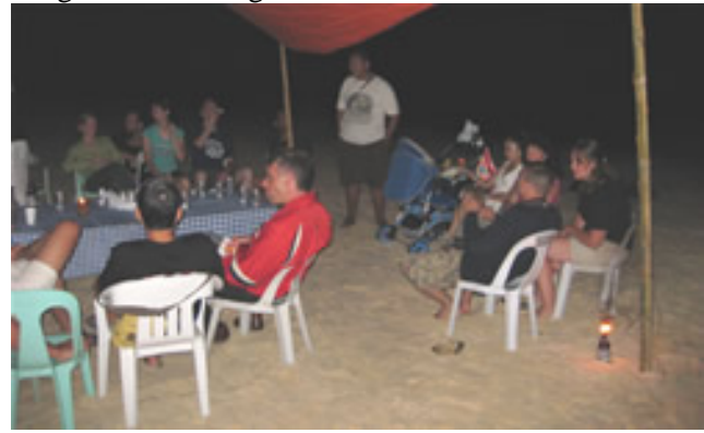
In the evening a get together