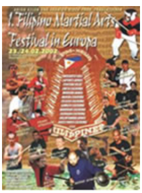
1st FMA Festival

Filipino Grandmasters handled Traditional and Classical Arnis from the different Filipino martial arts Organizations. Nightly events and special tours brought martial artists together in the spirit of historical and cultural grandeur. On the sixth day was a Sports Festival then the grand finale Gala Night that was unforgettable of martial culture crowned the festival on the last night in Iloilo City, Philippines.