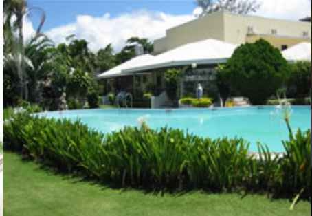
Pool and bungalows